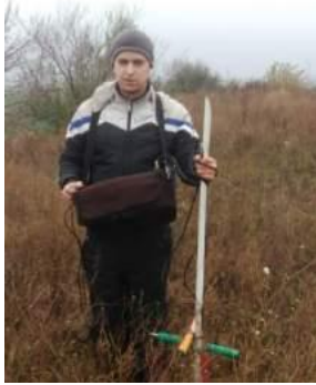
Figure 2. Operator with microprocessor indicator of an electromagnetic field with three antennas during field survey

shown in Figure 2. Time to conduct research – 4 hours.